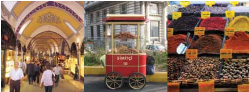
Istanbul is famed for its bazaars, including the Grand Bazaar, and its tasty food from spices to sweets

world's largest diamonds. A stroll through the palace gardens leads to Hagia Sofia. Built by Emperor Justinian, the Church of the Divine Wisdom served as the city's chief mosque for five centuries following the Ottoman conquest in 1453. Staring up at the magnificent domed ceiling decorated with 30 million gold mosaic tiles you understand why Emperor Justinian said, "Solomon, I have surpassed thee!" when he inaugurated the building in 537.