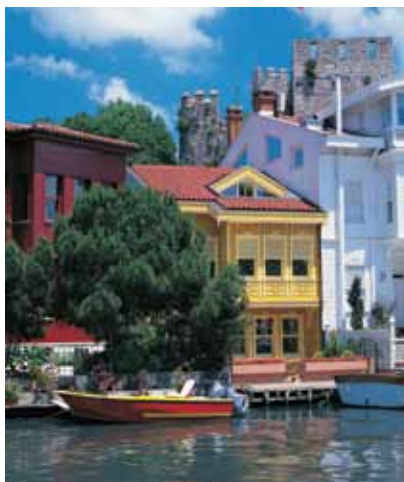
Above: colourful buildings line the shores of the Bosphorus